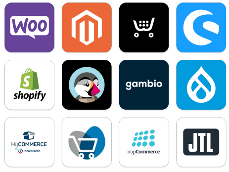
incl. further plugins & integrations